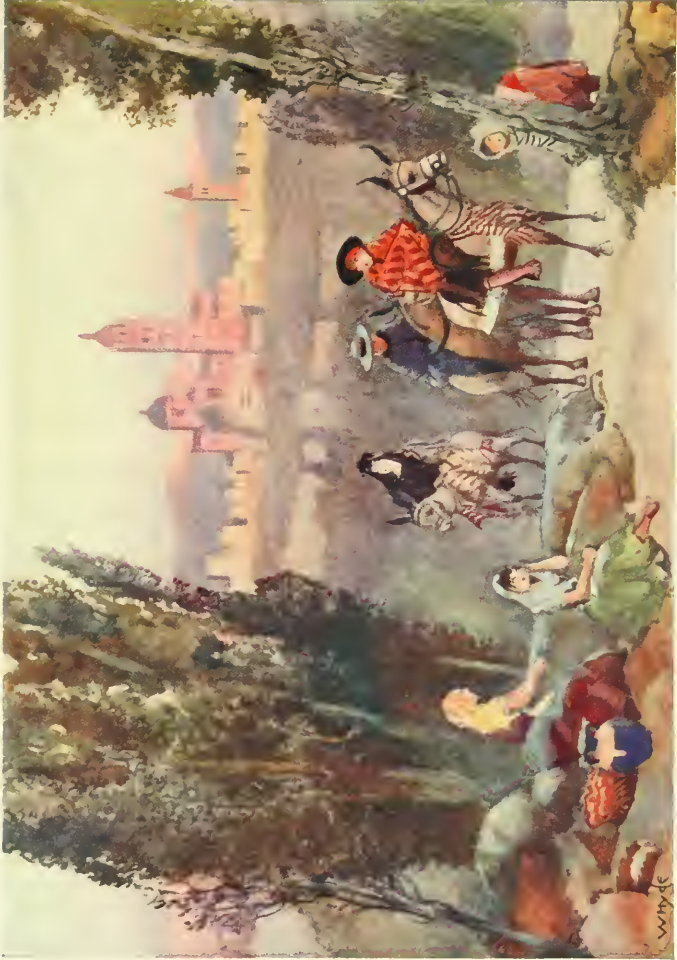
THE TOWERS OF SEGOVIA.